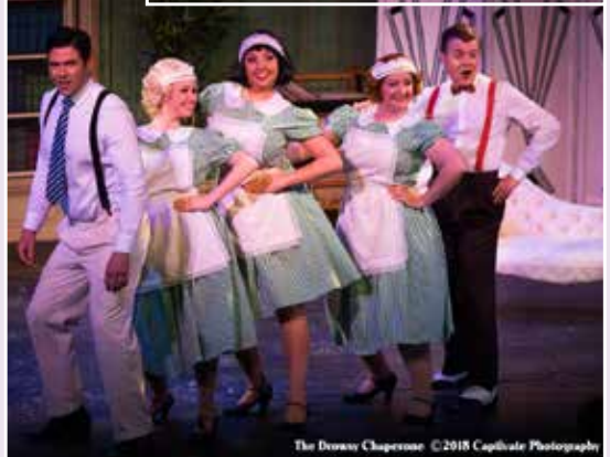
The Down Chaperone