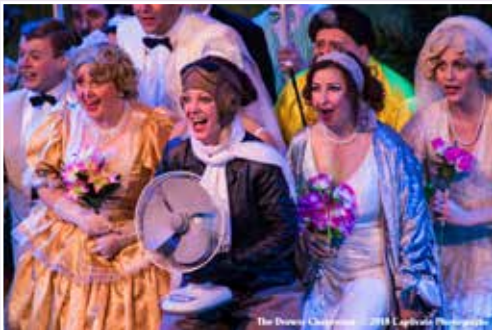
The Down Chaperone